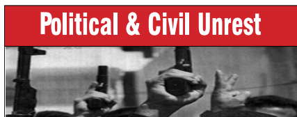
Political & Civil Unrest

London, Jul 28 -- A press report, dated today, states: Mexico's Volcano of Fire staged a spectacular, predawn explosion today, shooting incandescent rock, ash and steam nearly 9,000 feet into the air over western Mexico. The eruption sent ash raining down on nearby communities, but officials had no reports of major damage. The 12,533-foot volcano has had several strong explosions in recent months, but officials have said the activity is normal. The volcano straddles the border of Jalisco and Colima states and is located 430 miles west of Mexico City. It is considered among the country's most active and potentially most destructive volcanoes.