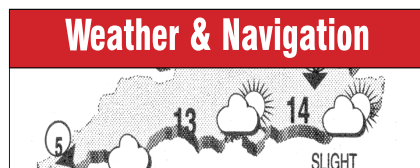
Weather & Navigation