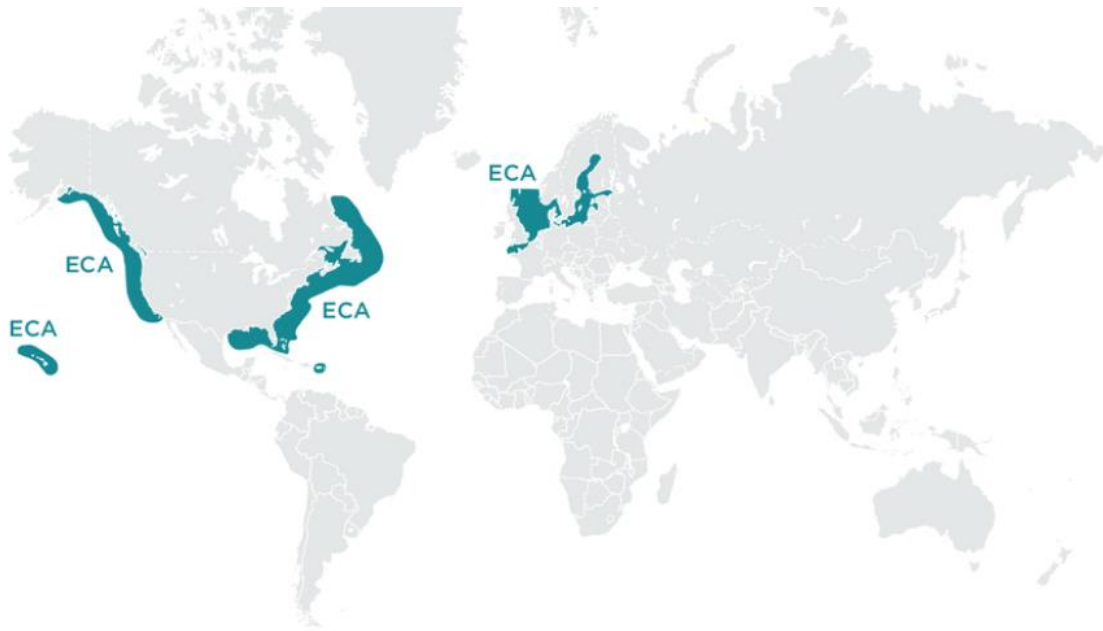
Figure 2 : Existing Emission Control Areas around the world.

Overall, the evolution of regulations on marine pollution from ships reflects a growing recognition of the importance of protecting marine ecosystems and human societies from the negative impacts of ship pollution. While there is still much work to be done in this area, the development of international conventions like MARPOL and the establishment of ECAs represent important steps towards a more sustainable and environmentally responsible maritime industry.