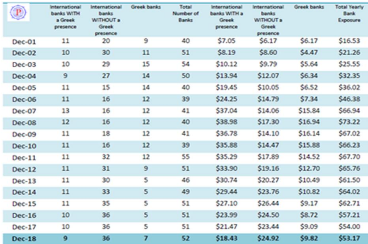
Figure 3: Greek shipping portfolios in billions of dollars from the international banking system 2001 - 2018.

However, in order to understand the size of maritime financing in the Greek shipping industry, a Petrofin table will be followed which lists the portfolios as well as the number of banks from 2001 to present involved in the aforementioned sector.